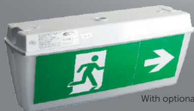
With optional 09046 Exit Blade attachment