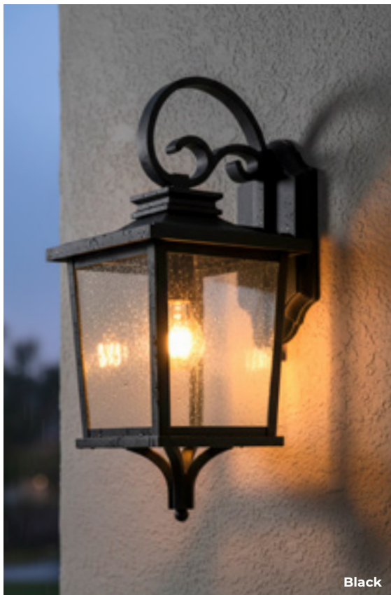
▲ lamps not included