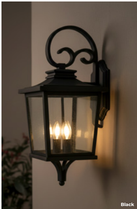
▲ lamps not included